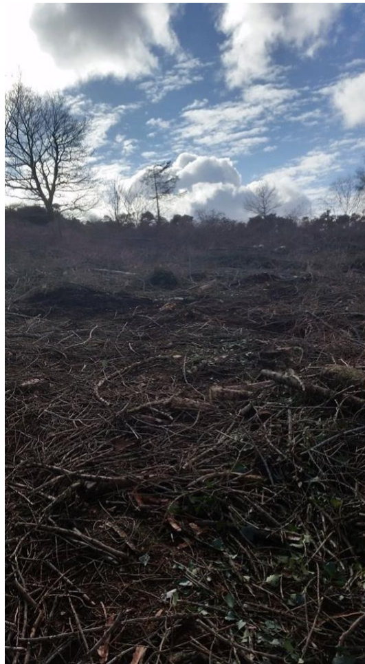
Butterdon Wood compartment 2, spring 2024